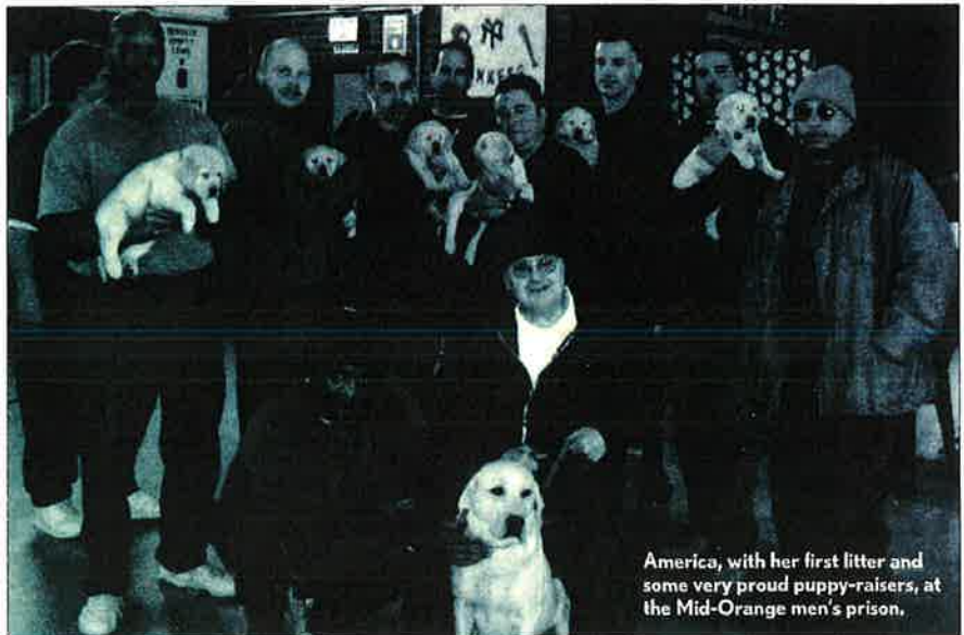
America, with her first litter and some very proud puppy-raisers, at the Mid-Orange men's prison.

Pups suited to service-dog work prefer to take human direction, and love to retrieve and carry